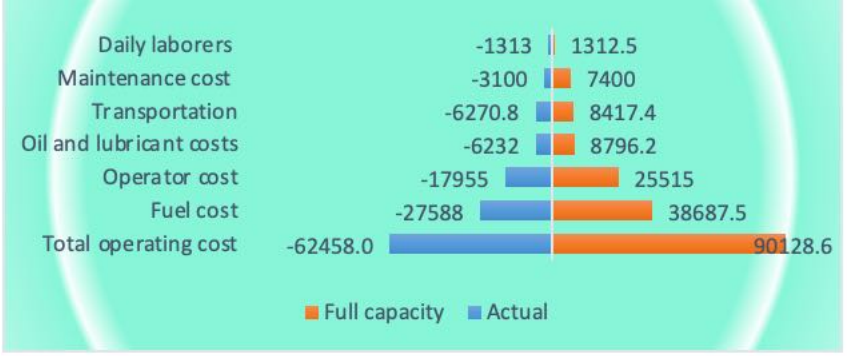
Figure 3: Actual and potential operating costs- multi-crop thresher