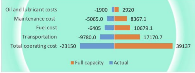
Source: Computed from the financial recording book of the SPs Figure 1: Actual and potential operating costs-Bako model

On the other hand, the average actual operating cost of the maize dehusker-sheller machine was found to be Birr 23,150, with costs ranging from Birr 16,720 to 29,580 depending on location. However, the entrepreneurs could not work for the entire threshing season due to late acquisition of the machines coupled with too many non-working religious holidays. Hence, this cost does not reflect the potential operating costs of the business. With the potential working capacity, however, the average operating cost would have risen to Birr 39,137. Fuel expense was found to be the major cost item of all operating costs, followed by maintenance and oil and lubricants. The actual average operating cost of the Bako-model sheller machine was calculated to be Birr 26,984, which would rise to Birr 32,679.4 with the potential working capacity. Similarly, the highest share of the total operating costs of the dehusker-sheller machine was for fuel expenses, followed by remuneration and maintenance costs, Figure 2.